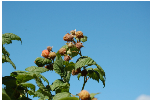
Raspberries ready to ripen (left) as the garlic crop glistens in the summer sun (right).